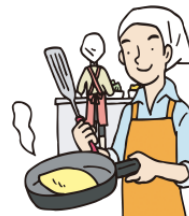
cook / make an omelet