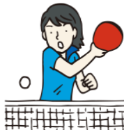
play table tennis