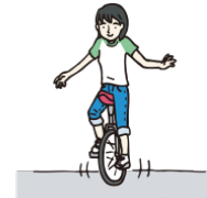
ride a unicycle