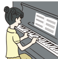
play the piano