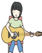
play the guitar